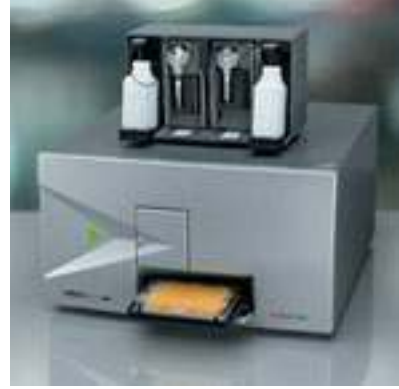
Fig. 1 - Multi-plate reader used for the determination of the DPPH scavenging activity

a plateau in about 1 hour. In some cases the percentage of DPPH at the plateau level can be calculated: DPPH° remaining in a stable state (%) = [(Ci - Cf) / Ci] \times 100 . The antioxidant activity of the wine is thus defined by the dilution of wine required to decrease the initial concentration of DPPH° by 50%: Effective dilution = ED50.