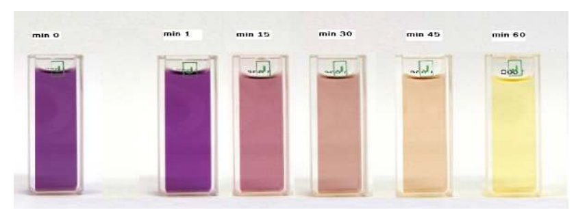
Fig. 3 - Consumption of methanolic solution of DPPH radical, by colour changing of the diluted sample (from purple to yellow) in a single dilution (D5) for 60 minutes in air