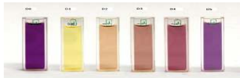
Fig. 2 - Consumption of methanolic solution of DPPH radical by colour change (from purple to yellow) in the five dilution (D<sub>1</sub>, D<sub>2</sub>, D<sub>3</sub>, D<sub>4</sub> and D<sub>5</sub>) compared to the control D<sub>0</sub>

In figure 2 it's presented the effect of concentration of red wine upon different dilution in 5 min from start of the reaction. The other figure presents the instability of this solution in time as result of wine matrix (the lowest dilution).